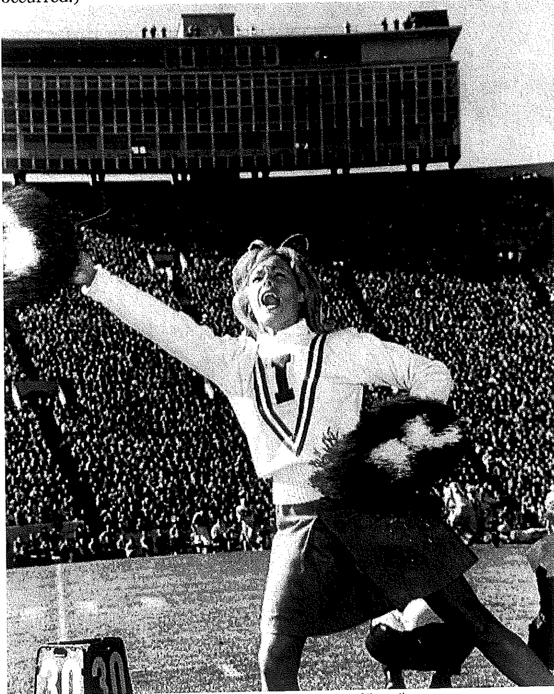
Carroll cheerleading at Indiana University in 1965.

an octopus. I don't know how many people are in the opening you possess. Reader, but Moonves, with his arms squirming and poking and goosing and scooping and pricking and prodding and jabbing, is looking for fissures I don't even know I own, and — by God! — I am not certain that even if I pull off one of his arms it won't crawl after me and attack me in my hotel bed. Hell, I am thrilled I escape before he expels his ink. Naturally, I do not mention this in the article. I am a member of the Silent Generation. We do not flap our gums. We laugh it off and get on with life. (Moonves, for his part, told New York he “emphatically denies” the incident occurred.)