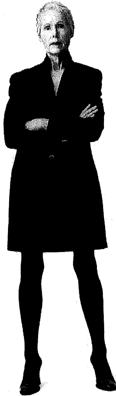
E. Jean Carroll.

Case 1:22-cv-10016-LAK Document 180-1 Filed 05/11/23 Page 7 of 19 crossed out here]. I have to [sic] many things to do—rather than waste my time with CREEPY BOYS. (signed) Jeanie Carroll