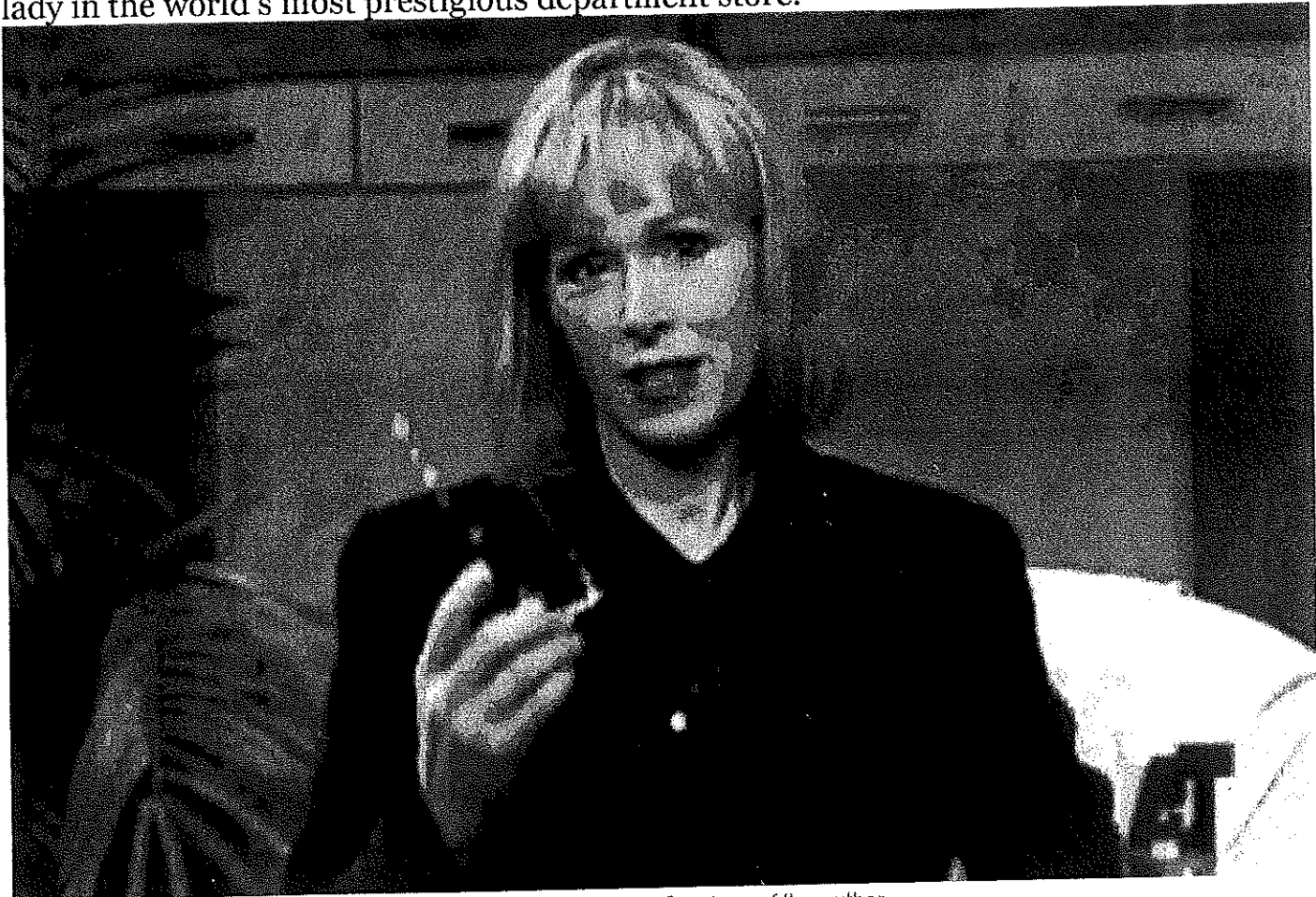
On the Ask E. Jean show, which aired from 1994 to 1996.

His admirers can't get enough of hearing that he's rich enough, lusty enough, and powerful enough to be sued by and to pay off every splashy porn star or Playboy Playmate who "comes forward," so I can't imagine how ecstatic the poor saps will be to hear their favorite Walking Phallus got it on with an old lady in the world's most prestigious department store.