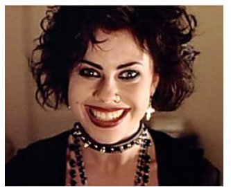
Remember Her? Take A Deep Breath Before You See What She Looks Like Now