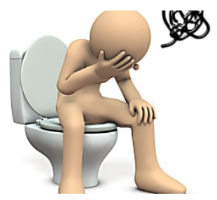
Early Signs Of Ulcerative Colitis. See About Symptoms & Treatments